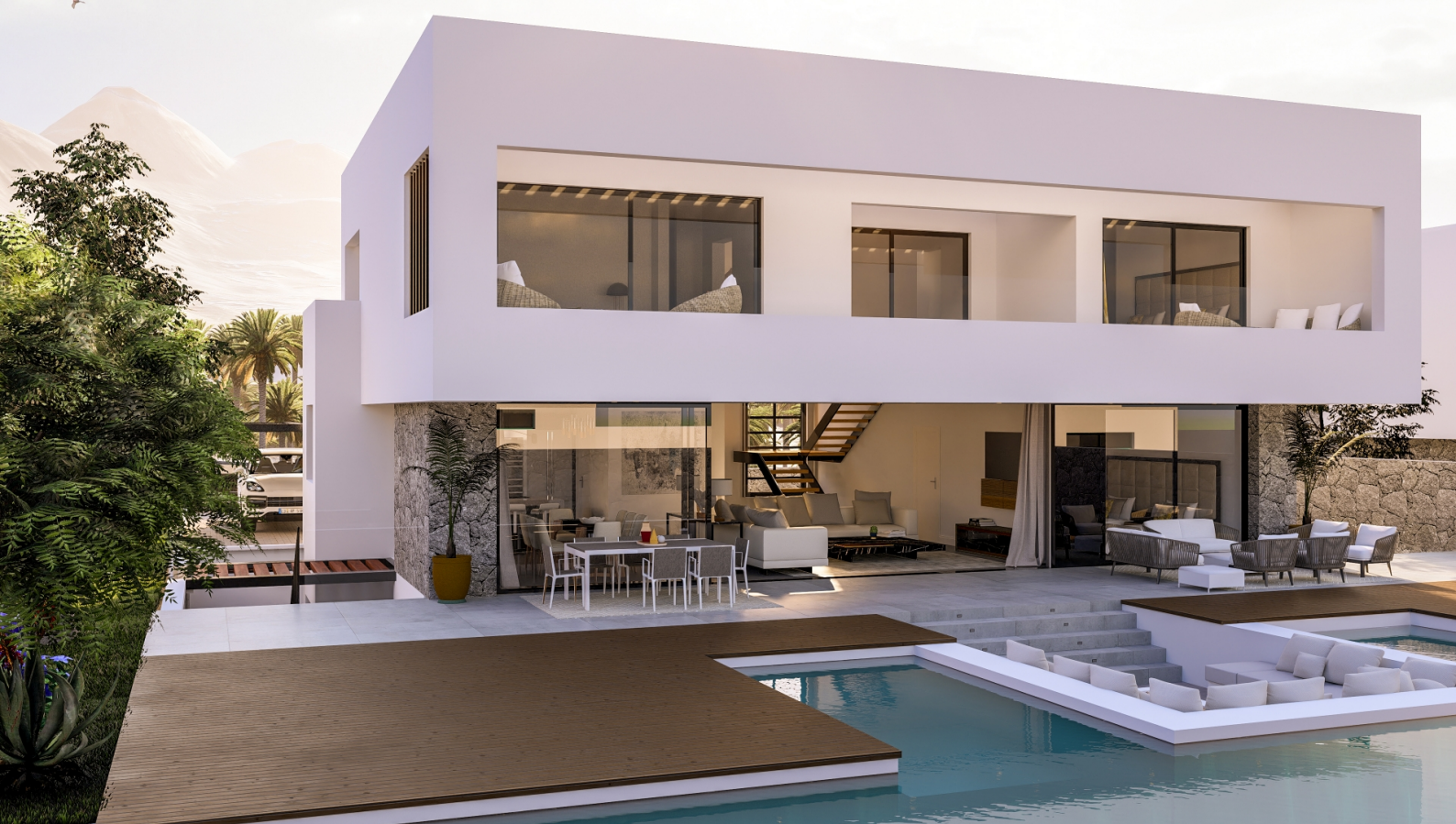
Property photo 1